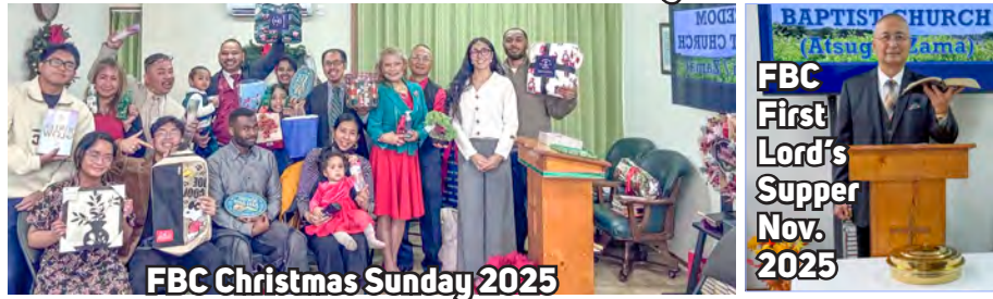
FBC First Lord's Supper Nov. 2025