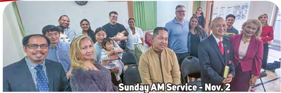
Sunday AM Service - Nov. 2